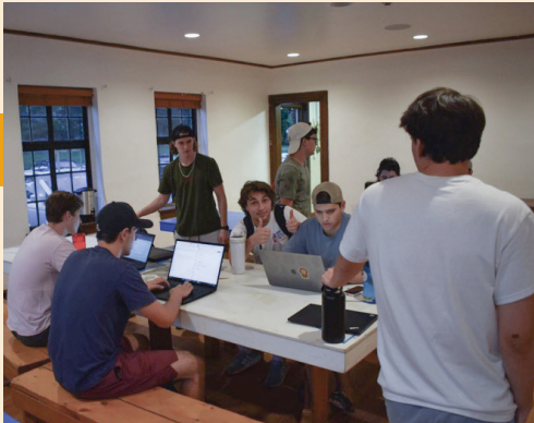
Brothers participate in a résumé workshop for the career fair.