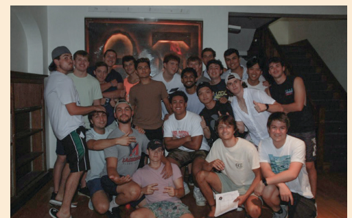
Alpha Chapter's active brothers.